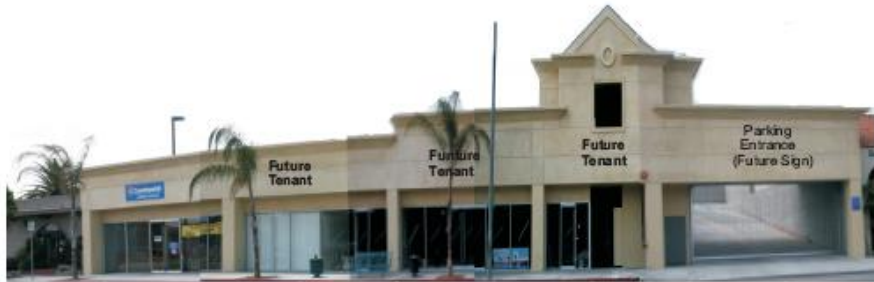
MASTER SIGN PROGRAM