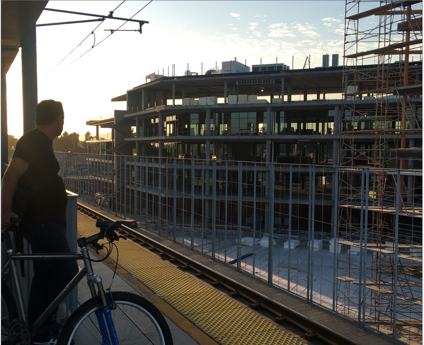
Ivy Station construction

Noise from various sources affects Culver City's residents, workers, and visitors. Noise results from mobile sources, such as transit and vehicles. In addition, noise results from stationary sources, including residential and nonresidential land uses, construction and maintenance activities, late-night entertainment, and machinery sources.