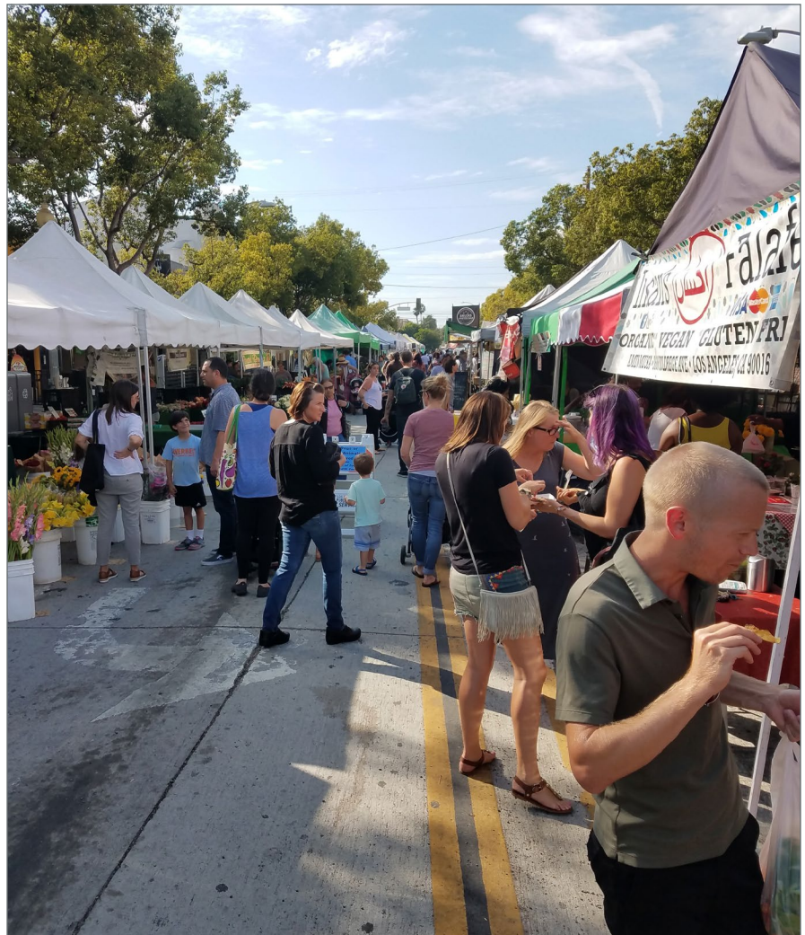
Street festival in Culver City