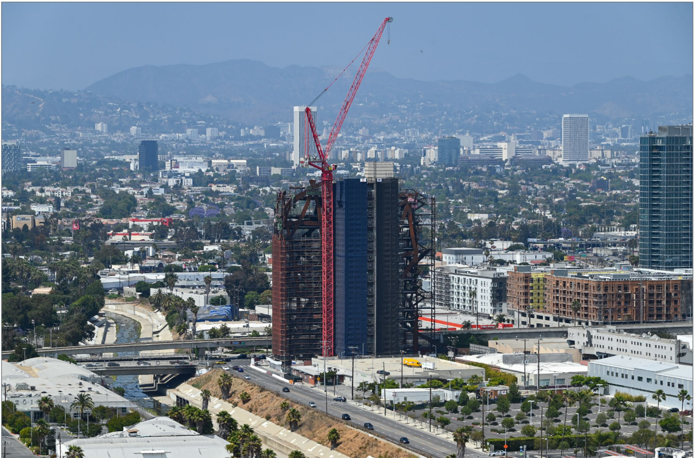
New construction near Culver City

An expression of the relative loudness of sounds in air as perceived by the human ear