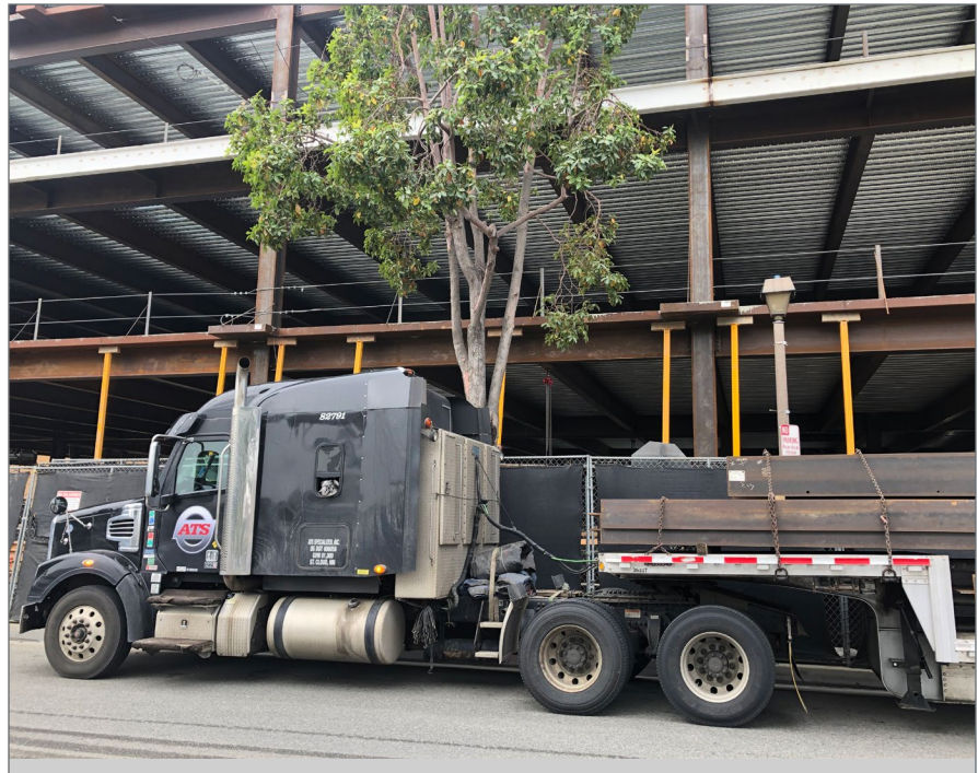
Trucks are a mobile source of noise

On July 19, 2019, the City requested permission from the United States