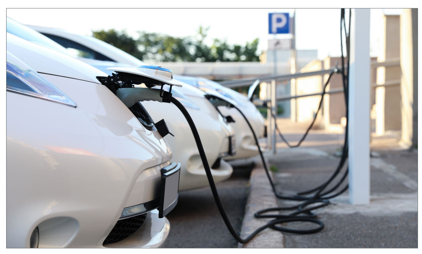
Electric vehicle charging