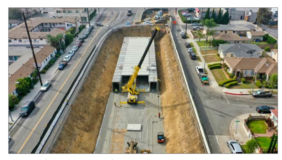
Construction of Culver Blvd stormwater infrastructure.

Culver City's wastewater infrastructure relies on the Hyperion Wastewater Treatment Reclamation Plant located in Playa del Rey, which is projected to have adequate capacity to continue to serve the city. Sewage is conveyed through a series of gravity mains and lift stations, and ultimately through trunk sewers to the centralized process site. All the wastewater collected at the site is either recycled or discharged into the Pacific Ocean via a 5-mile submerged outfall pipe in Santa Monica Bay. In addition to the treatment plant's energy and maintenance costs, the conveyance system also requires maintenance and energy for pumping. Future considerations include potential increased potable water demands which translates to increased wastewater treatment flows. The City abandoned the Mesmer and Overland wastewater pumping stations and constructed a new station on Bankfield Avenue to improve capacity and operations. These improvements redirected flows, lowering energy and maintenance costs. These improvements also reduced the potential for