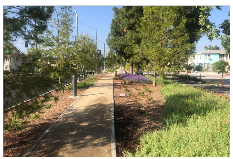
Culver Boulevard Realignment and Urban Runoff and Stormwater Project