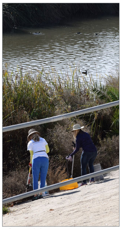
Ballona Creek cleanup